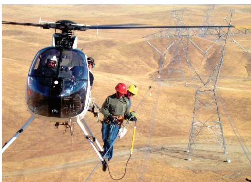
FireFly FF can be installed by helicopter

Recommended by the U.S. Fish and Wildlife Service, patented FireFly bird diverters have been shown in independent studies to be the most effective bird diverters in preventing bird strikes on power lines.