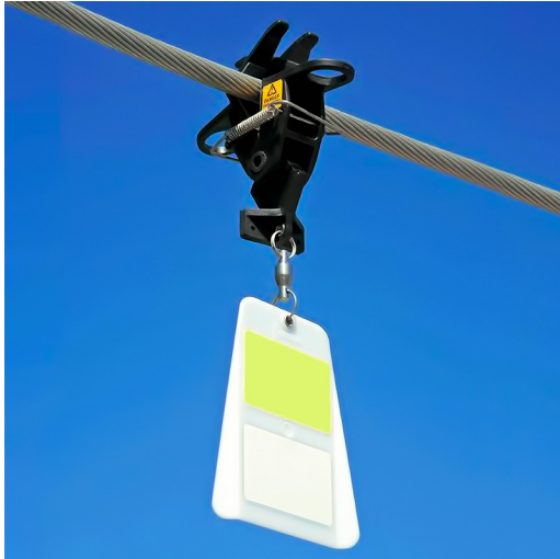
FireFly FF bird diverter